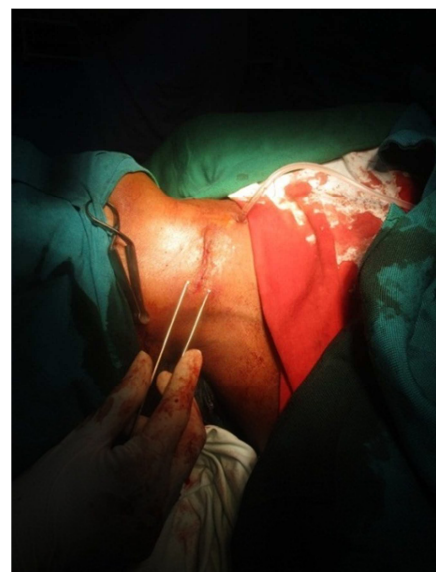
Figure 1. Incision being approximated with forceps.