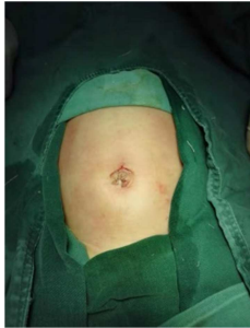
Figure 4. Umbilical incision after suture.