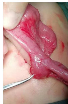
Figure 2. Pull MD out of abdominal cavity.