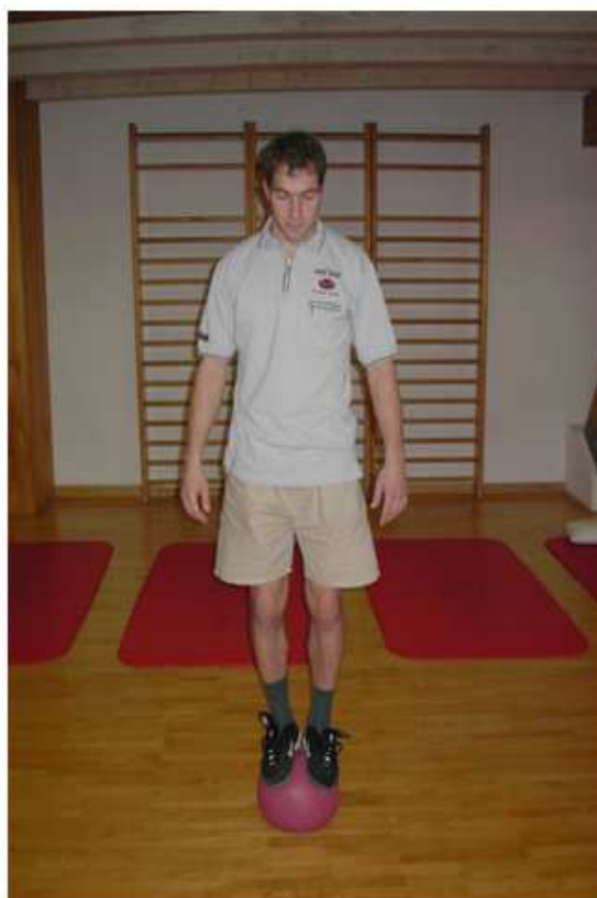
Figure 1. Proprioception and coordination exercise six weeks postoperatively.

both knees on the third day after surgery, which was also the date of his discharge. He was able to walk without crutches due to sufficient muscle control. The patient continued the second phase of rehabilitation in local physical therapy infirmary. The aim of the process during next five weeks was to achieve complete active flexion. Emphasis was on achieving functional gate. He began with basic exercises of proprioception (standing on one's toes or heels and shifting weight forwards, backwards, left and right). He was taught muscle-building exercises with various aids (elastic bands, weights) in the sitting and lying position as well as appropriate stretching techniques for the thigh and calf muscles. We started with the use of an exercise bicycle the third post operative week. From the fifth week onwards, the patient continued with close kinetic exercises. He gained in muscular endurance and vital capacity. He worked on increasing muscle mass in the gym, where he trained all muscle groups of the lower extremities along with isokinetic training. He gradually began developing explosiveness of the legs muscle. He did more advanced proprioception exercises coupled with elements of coordination (Figure 1). 4 months after the surgery, he began with running and jumping squats. Full sports activities were recommended after seven months.