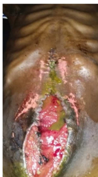
Figure 1. A 26 year-old with an iterative fistula following surgery for sigmoid volvulus. After three unsuccessful reinterventions to repair, the fistula persists with an alteration of the skin around and severe malnutrition.

In all cases, the medical treatment consisted of: rehydration, parenteral administration of antibiotics, vitamins, amino acids, blood transfusion and local care with absorbent dressings and a fistula collection device (Figure 3). Spontaneous closure of the fistula was obtained in 41 patients (59.42%) with a mean time of 23 days. Re-intervention was performed for persistence of the fistula (n=21) and